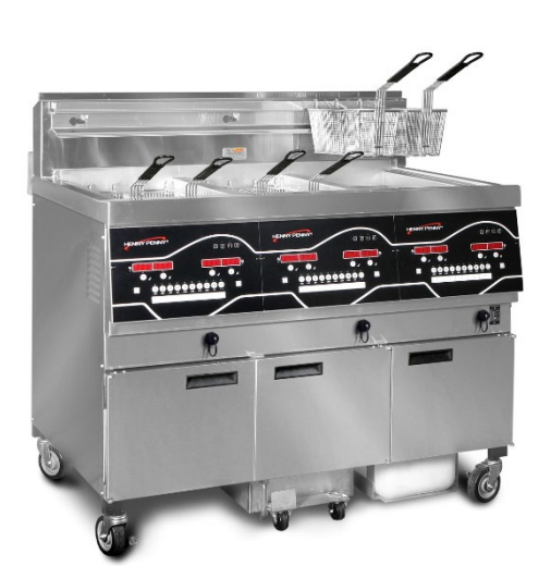
EEG 243 3-well gas open fryer